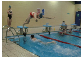
The Annual Swimathon raises over £10,000 for local and Rotary Charities

Membership - Deals with the general running of the Club and the welfare of our members. This covers all publicity aspects together with the speaker and inter club sports programme.